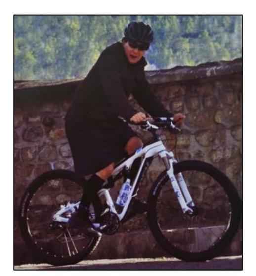
HM Jigme Singye Wangchuck 4th King of Bhutan