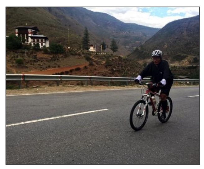
HE Tshering Topgay, Prime Minister of Bhutan