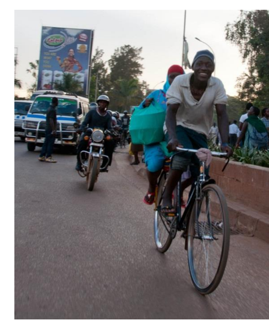
Kampala