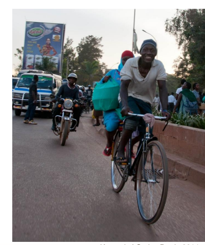
Kampala