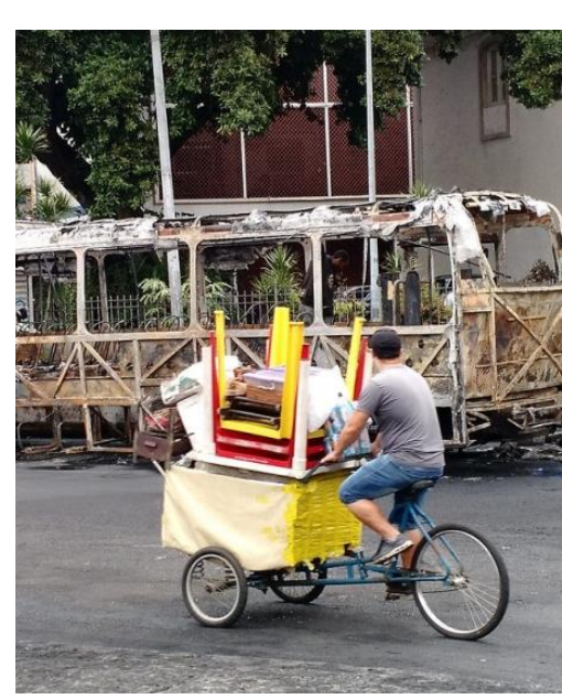
Rio De Janeiro | Jakob Baum 2017