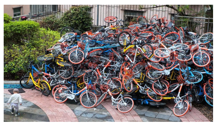
Beijing | Silent Hill/Imaginechina 2016