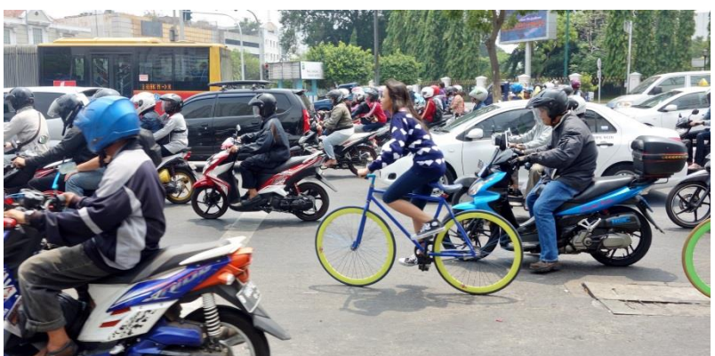
Support the willing, keep on pestering the others.