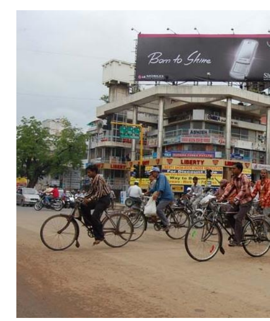
Ahmedabad