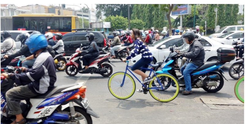
There is so much out there!