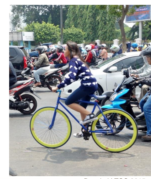
Bangkok | TCC 2015