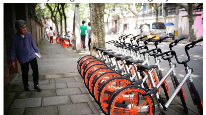
Beijing | Post Magazine 2016